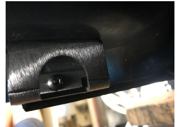
Bracket installed (Picture taken looking at the backside of the bracket, eye level)