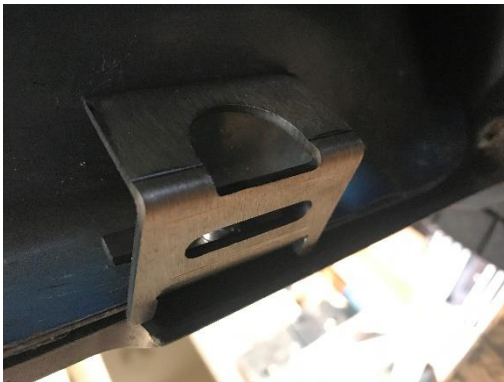
Bracket installed (Picture taken looking straight up under drip edge)