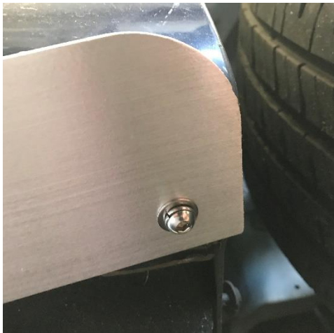
8. Install bolt with washer and lock washer

* REMINDER - THESE ARE SIDE SPLITTERS, DO NOT ATTEMPT TO STAND OR STEP ON SIDE SPLITTERS