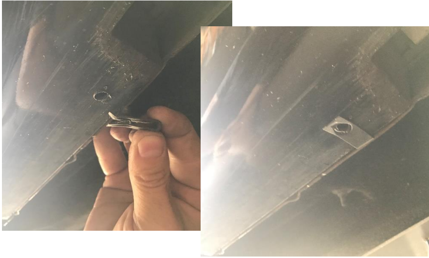
6. Install Speed Nut on Rocker Panel

7. Once all the holes and speed nuts are installed, line the side splitter up and work front to back installing one bolt at a time. Leave these loose until all have been installed, then work back to front tightening each bolt down.